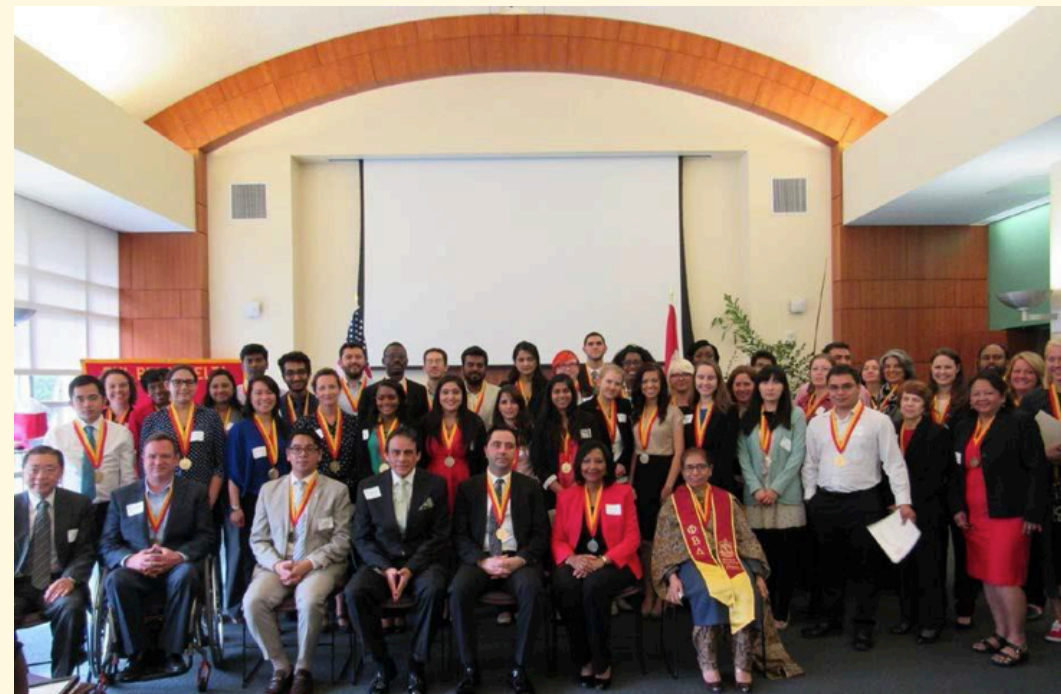
Induction Ceremony and Reception April 21, 2016