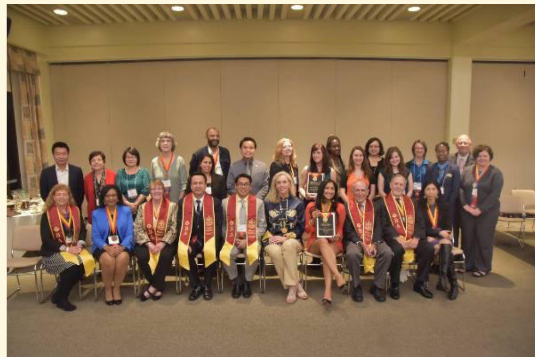
2015 Phi Beta Delta 29th Annual International Conference

CSUSB is proud to host the Phi Beta Delta headquarters and to support and celebrate the Society's achievements in the areas of International Education, Exchange and Outreach and for its 30th Annual Conference in Denver, Colorado